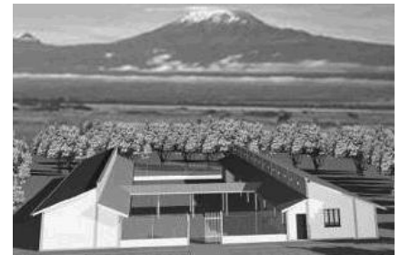
Architect rendering of the Mother-Child Health Clinic

St. Cecilia Parish is sponsoring a "Mediterranean Dinner" on Sunday, June 1st, starting at 2 p.m. The benefit is for " The Mother-Child Health Clinic Project. "